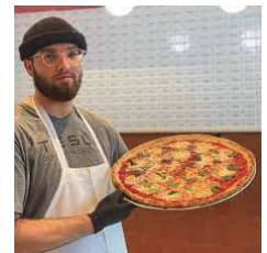
(make a pizza)

25) How much water was there in the glass?